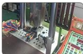
5. Ultrasound closing