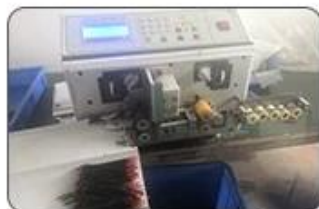
2 Cutting Cables