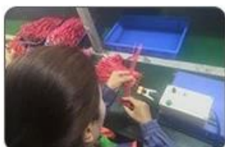
4 Welding checking