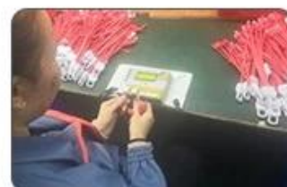
6 Final inspection