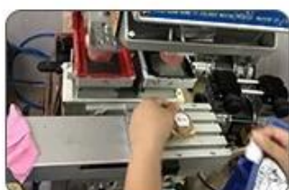
7 Logo printing