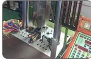
5. Ultrasound closing