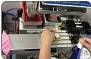
7 Logo printing