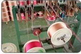
1 Making cable body