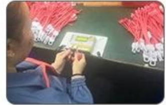
6 Final inspection