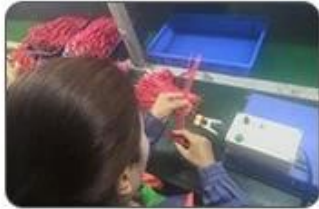
4 Welding checking