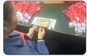
6 Final inspection