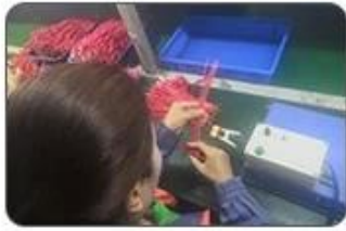
4 Welding checking