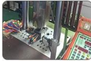
5. Ultrasound closing