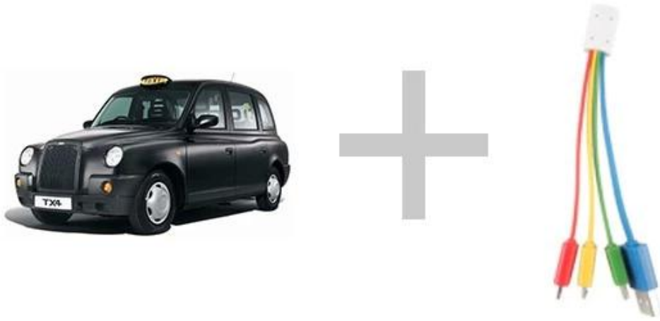
Figure 2 5-pin USB connection

When connecting the PMS device to the PC, use the USB Type-C to four-pin USB-A cable. The USB Type-C connector is connected to the PMS device and the four-pin USB-A connector is connected to the PC. The PMS device will be powered on and the LED indicator will be lit. The PMS device is now ready to be used.