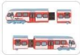
14. Finished products