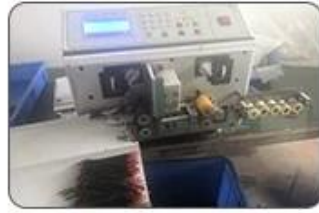
2 Cutting Cables