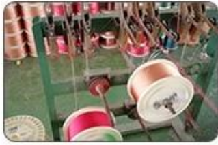
1 Making cable body