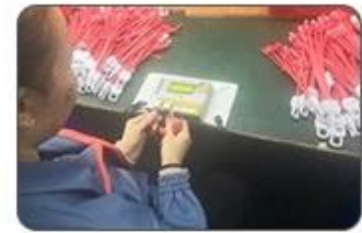
6 Final inspection