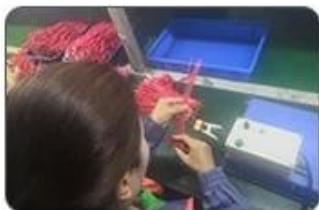
4 Welding checking