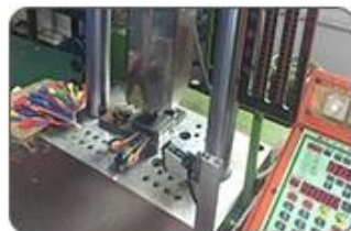
5. Ultrasound closing