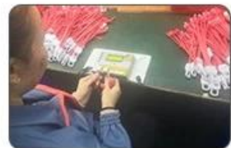
6 Final inspection