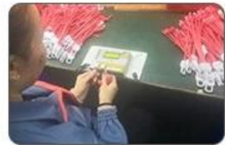
6 Final inspection