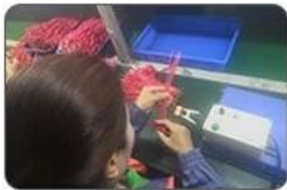
4 Welding checking