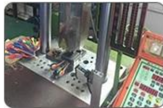
5. Ultrasound closing