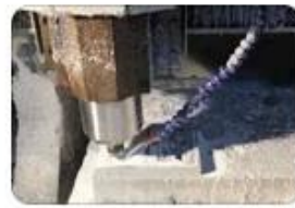
3. Mold making