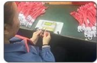
6 Final inspection