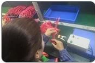
4 Welding checking