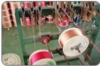
1 Making cable body