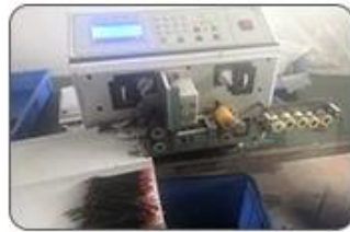
2 Cutting Cables