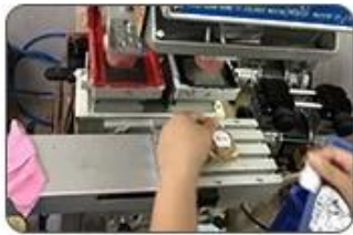
7 Logo printing